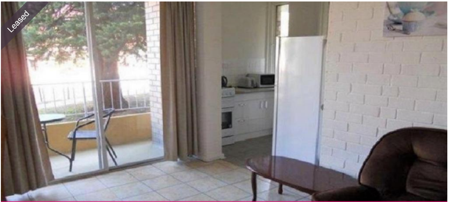
Unit 103, 112-122 Goderich St, East Perth