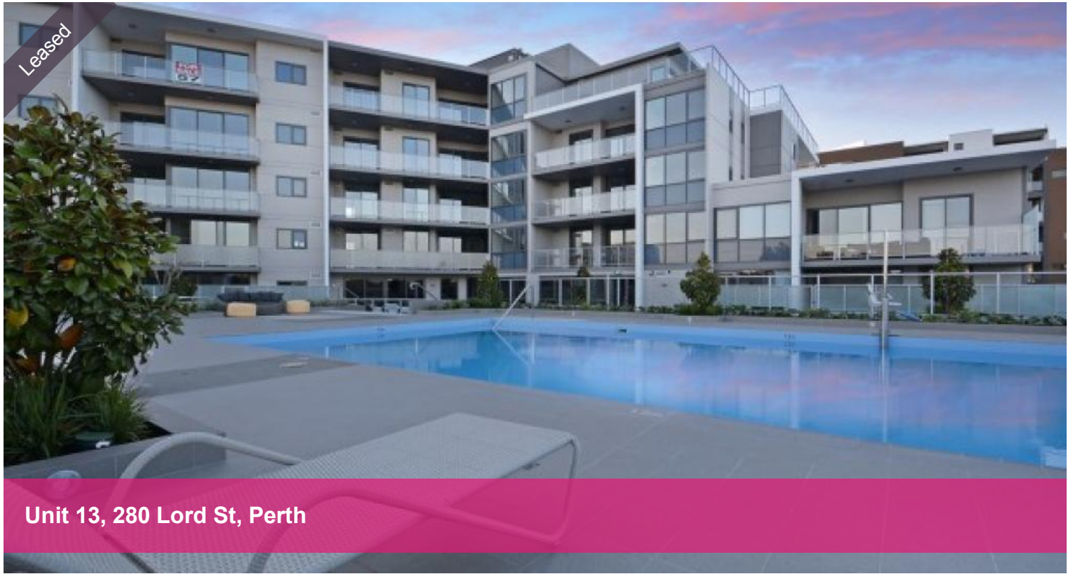
Unit 13, 280 Lord St, Perth