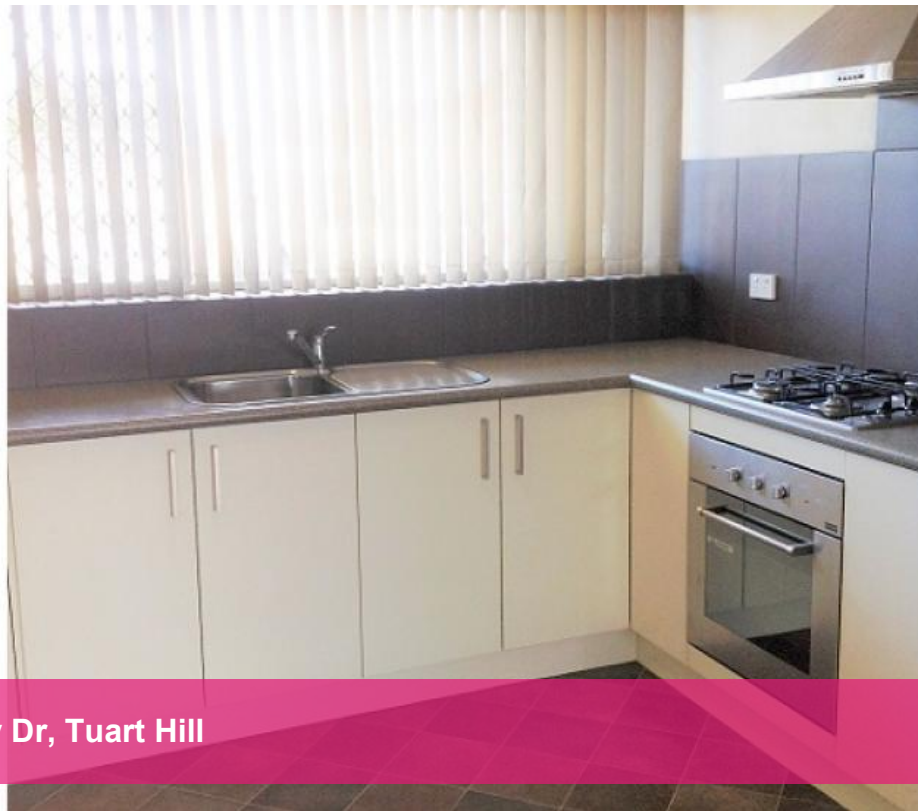
Unit 1, 10 Morley Dr, Tuart Hill