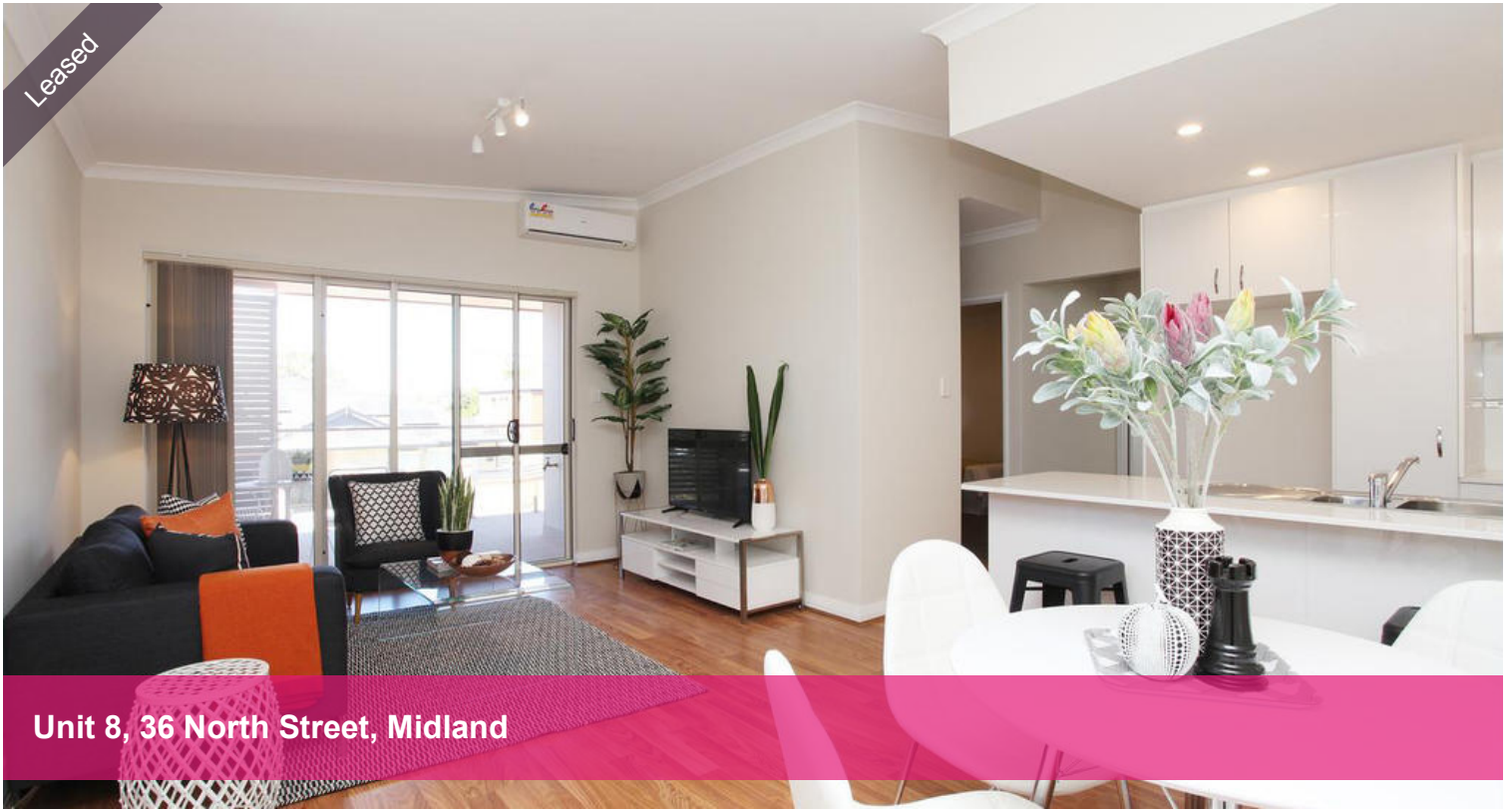
Unit 8, 36 North Street, Midland