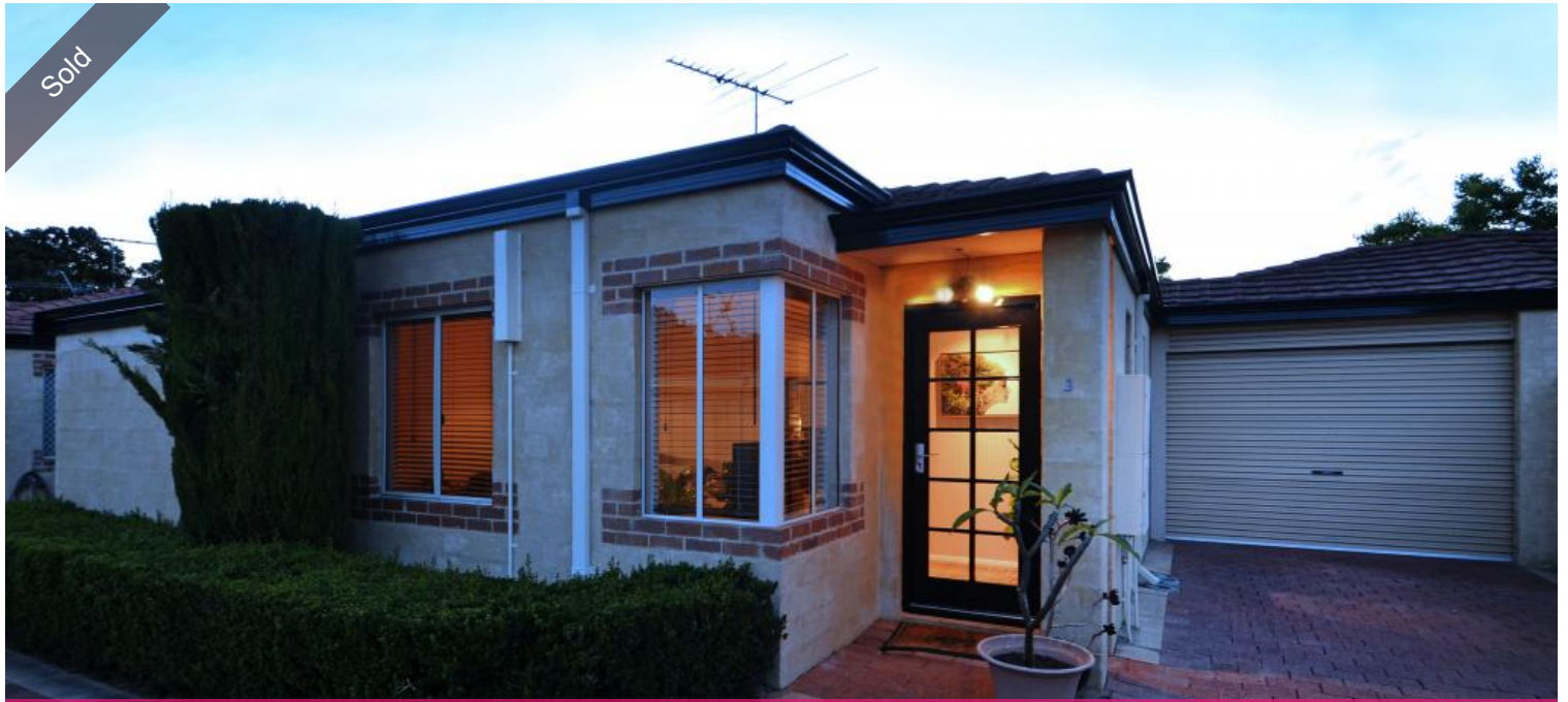
Unit 3, 172 Salvado Rd, Wembley