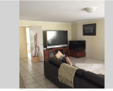
🚔 4 🔊 2 🛱 2

XceedRE have also teamed up with Green Zone Fitness & Goodlife Health Clubs around Perth to offer all of our new tenants 1 MONTH FREE