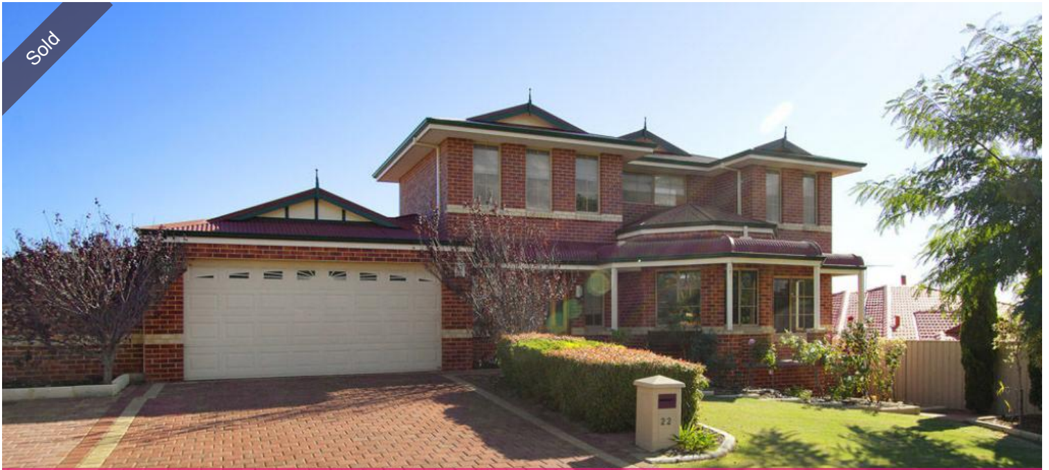
22 Finsbury View, Landsdale