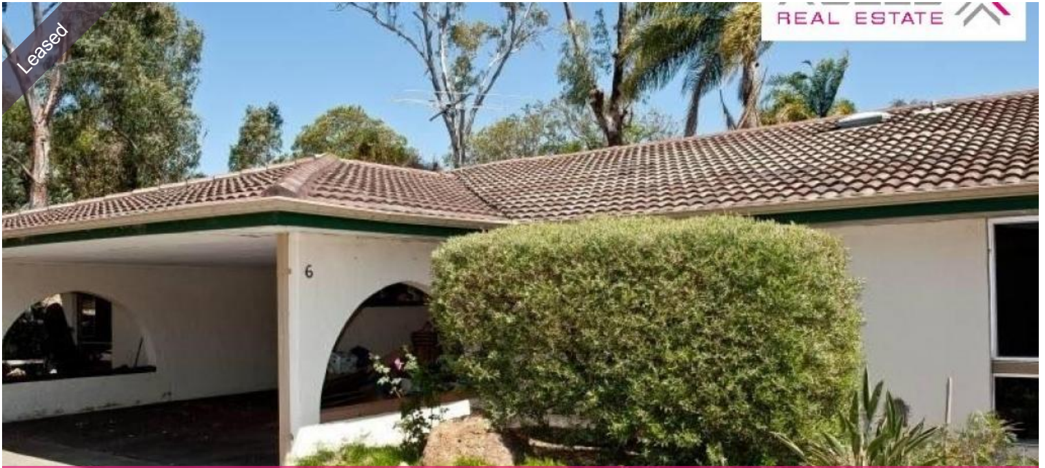
Unit 6, 86-88 Peninsula Rd, Maylands