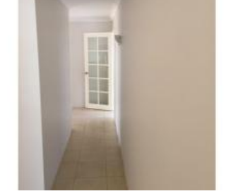
4 2 3 2