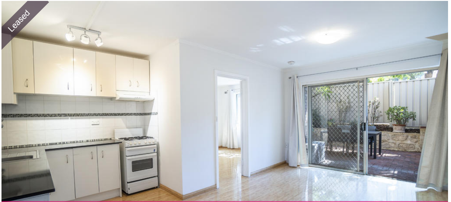
Unit 8, 209 Walcott St, North Perth