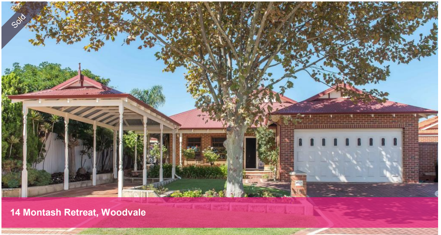
14 Montash Retreat, Woodvale