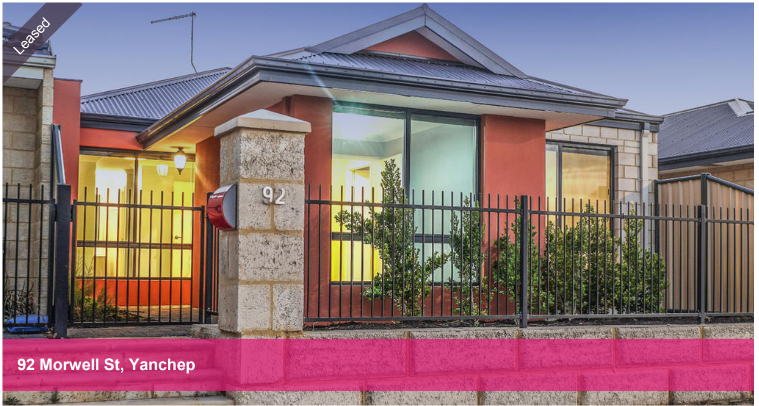
92 Morwell St, Yanchep