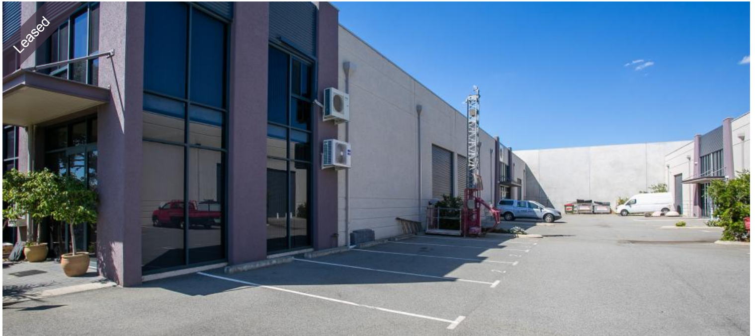
Unit 6, 10 Dillington Pass, Landsdale