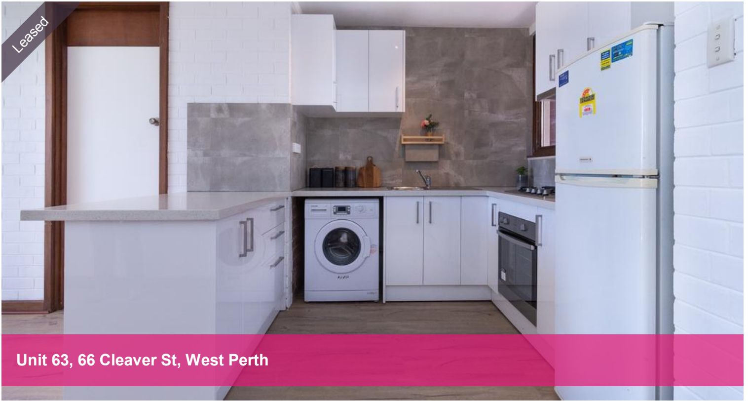
Unit 63, 66 Cleaver St, West Perth