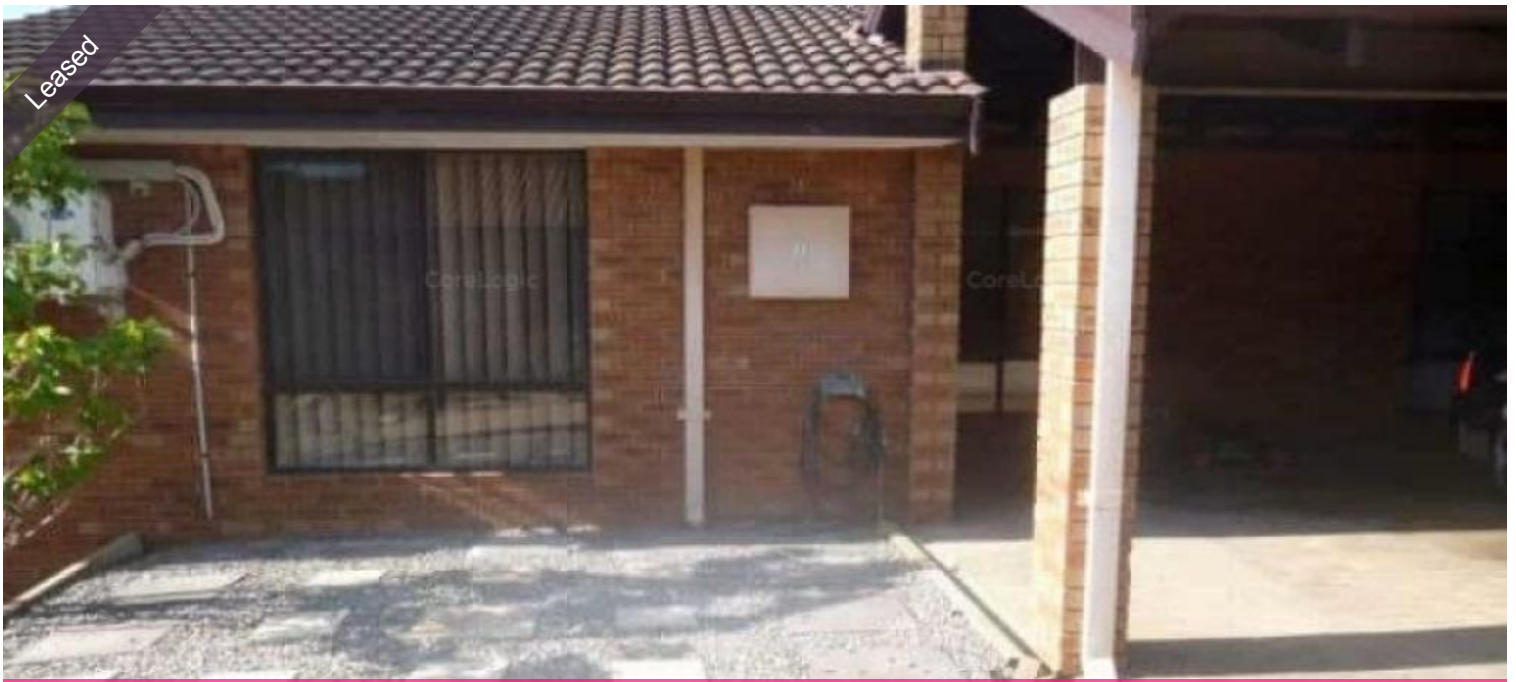
Unit 7, 139 Waterloo St, Tuart Hill