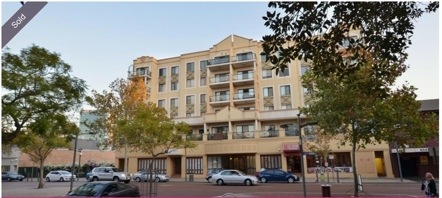
Unit 43, 191 James Street, Northbridge