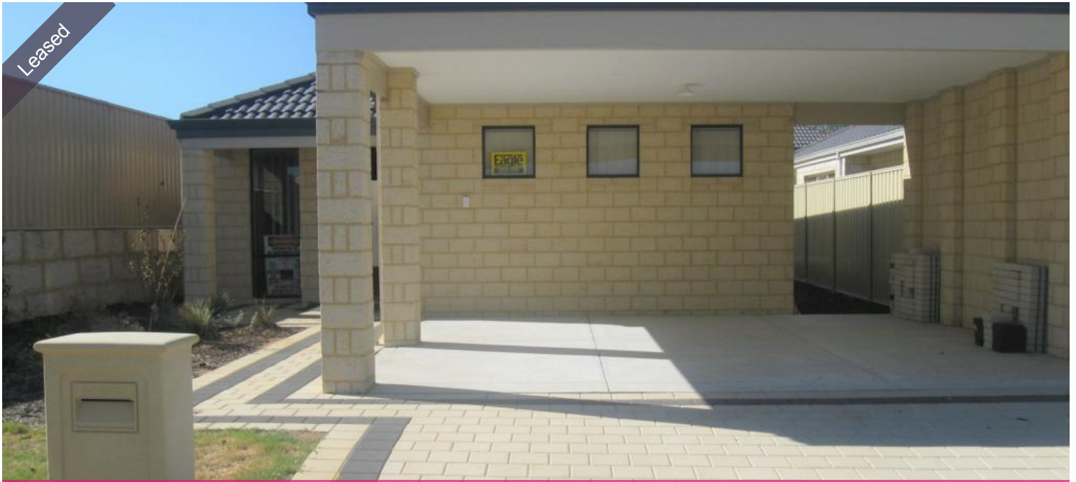
Villa, 28B Santa Rosalia Vista, Sinagra