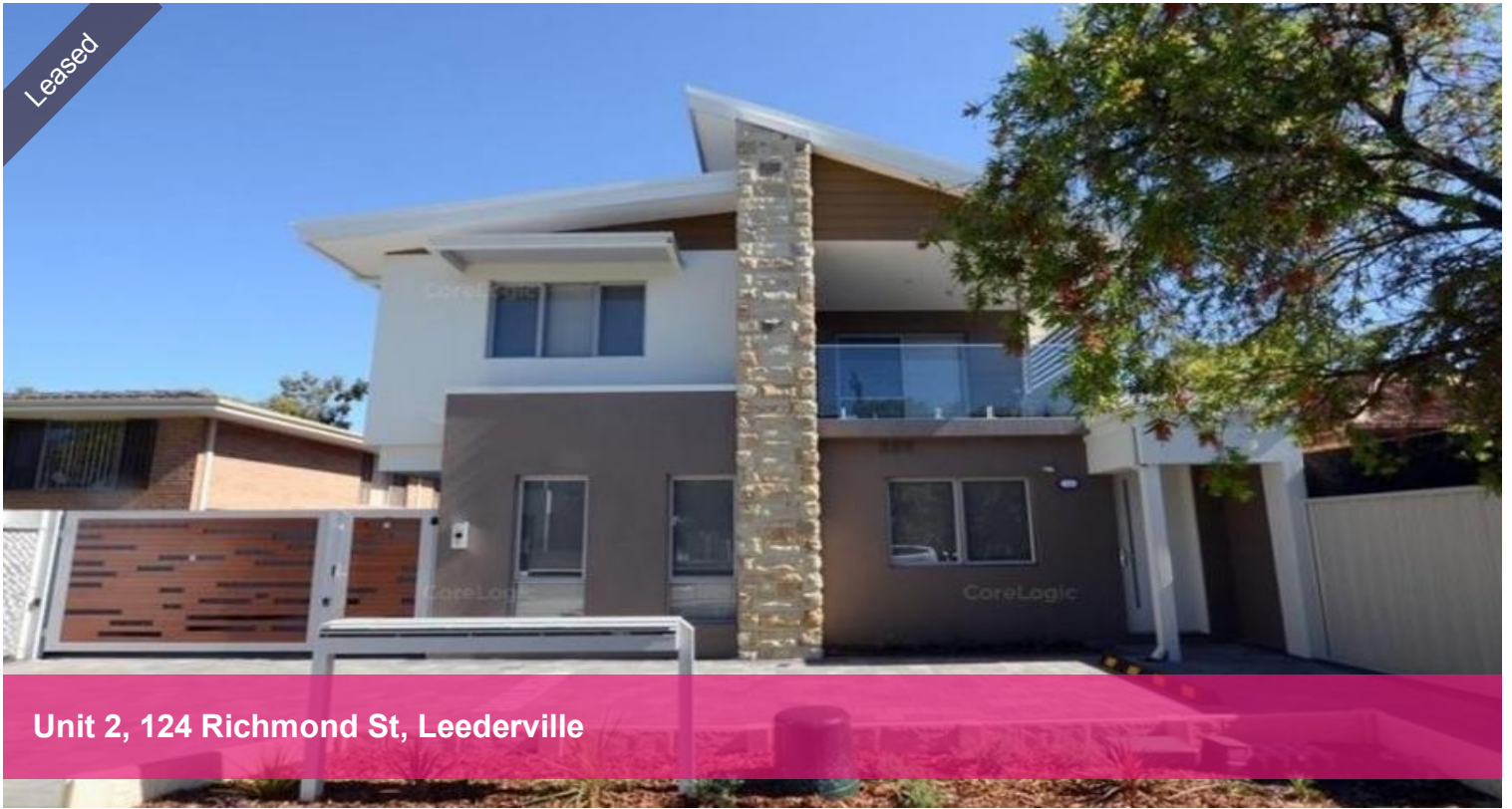
Unit 2, 124 Richmond St, Leederville