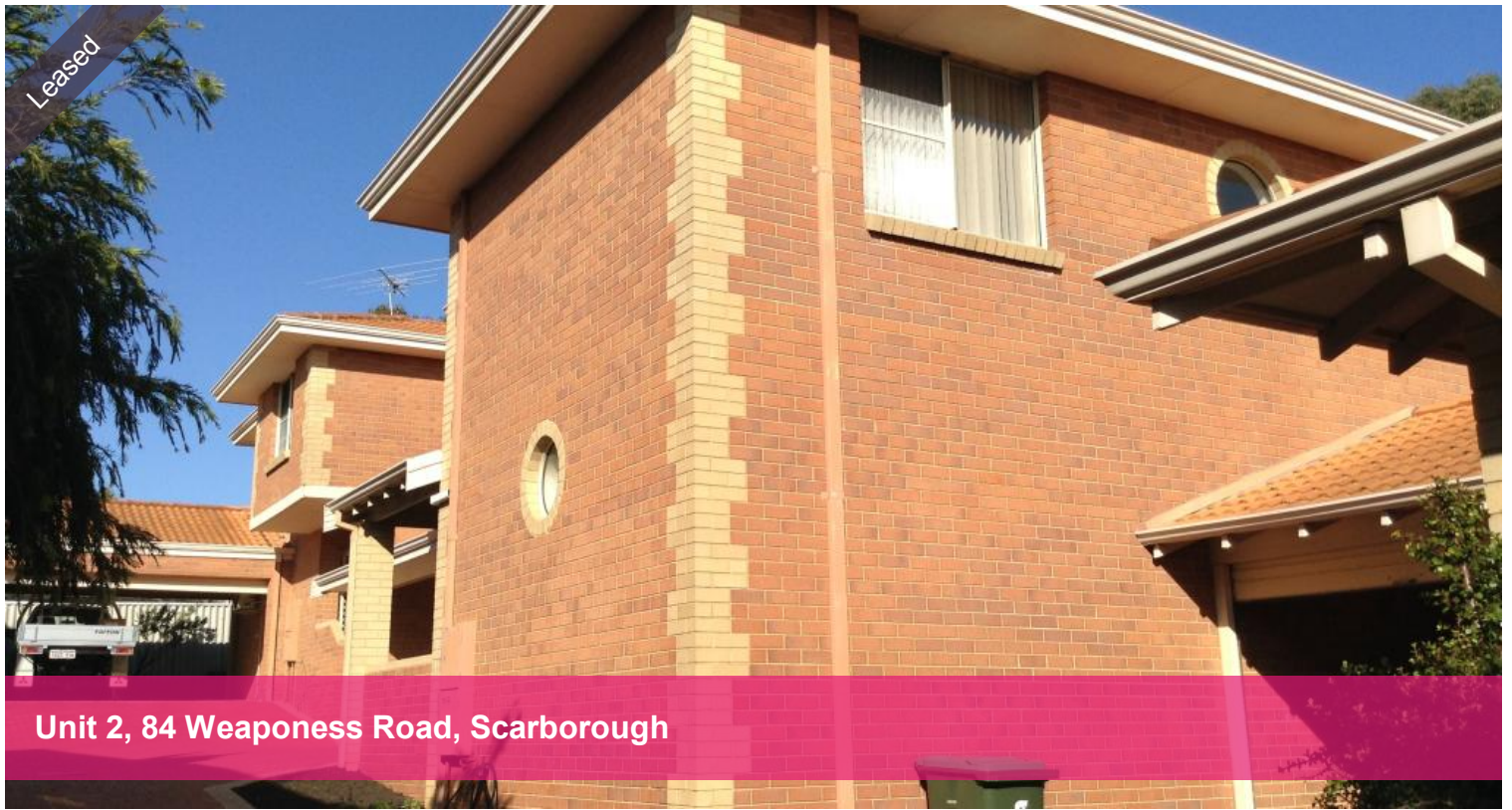
Unit 2, 84 Weapons Road, Scarborough