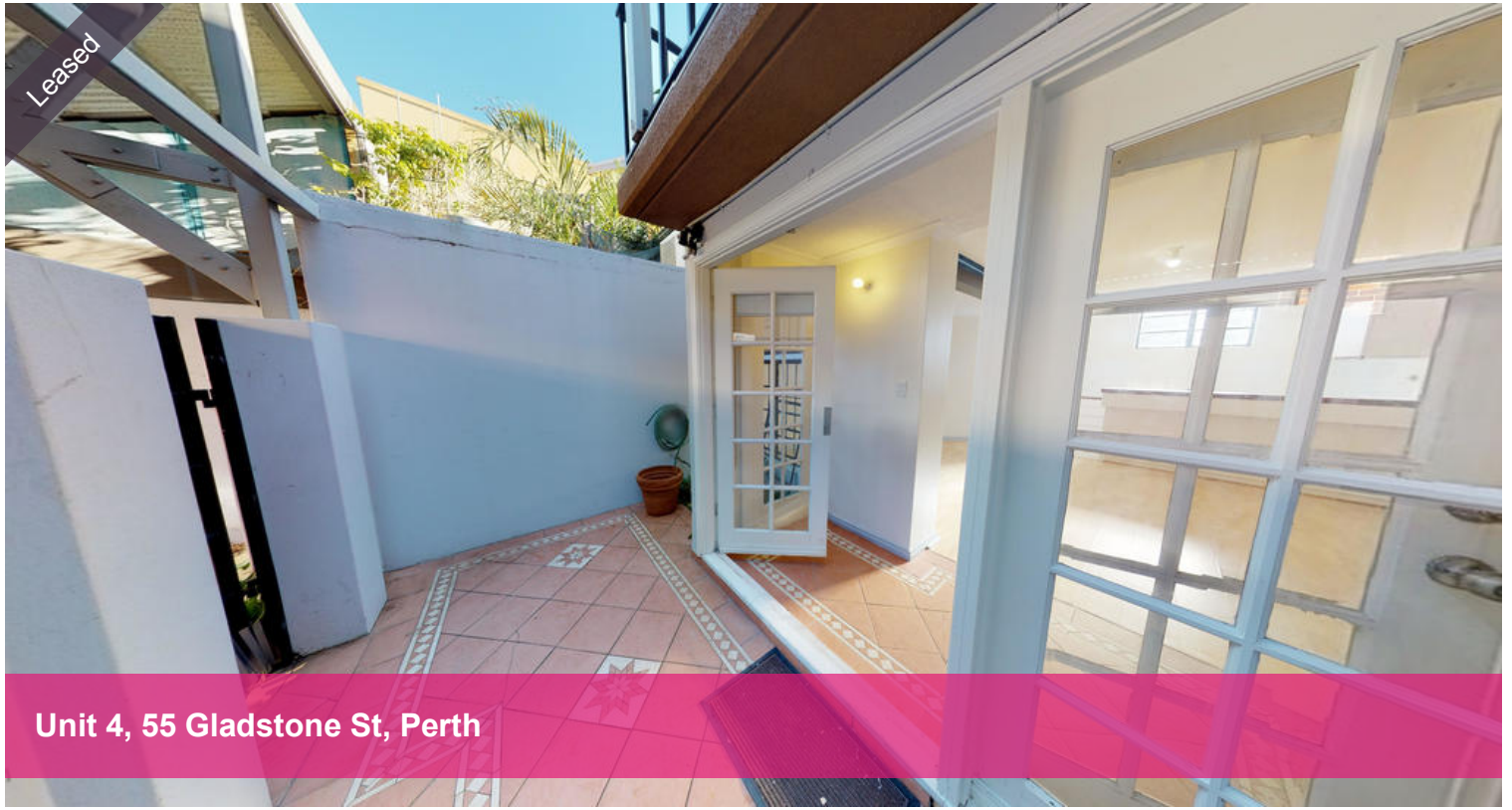
Unit 4, 55 Gladstone St, Perth