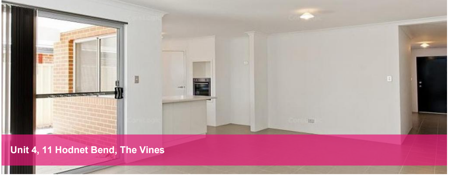
Unit 4, 11 Hodnet Bend, The Vines