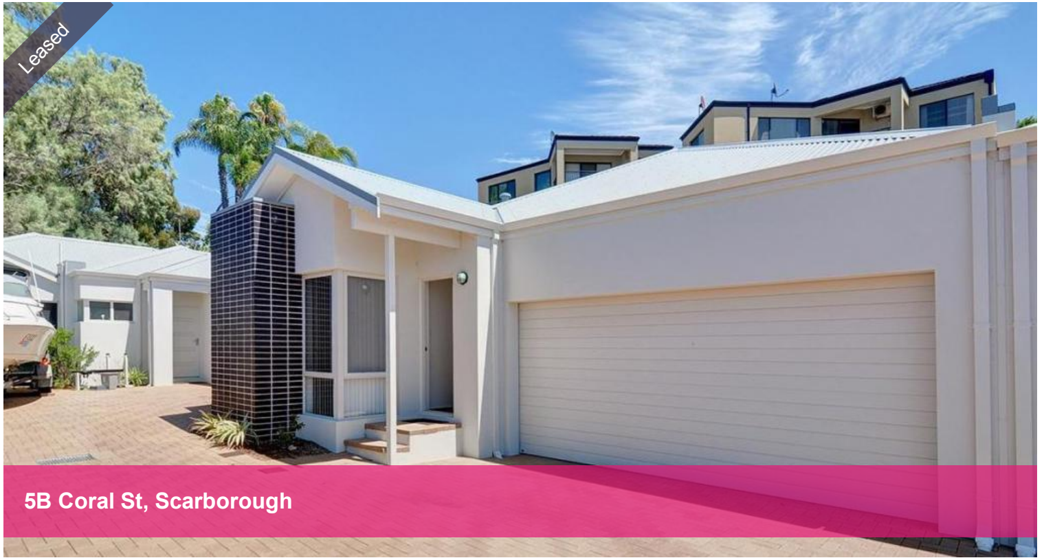
5B Coral St, Scarborough