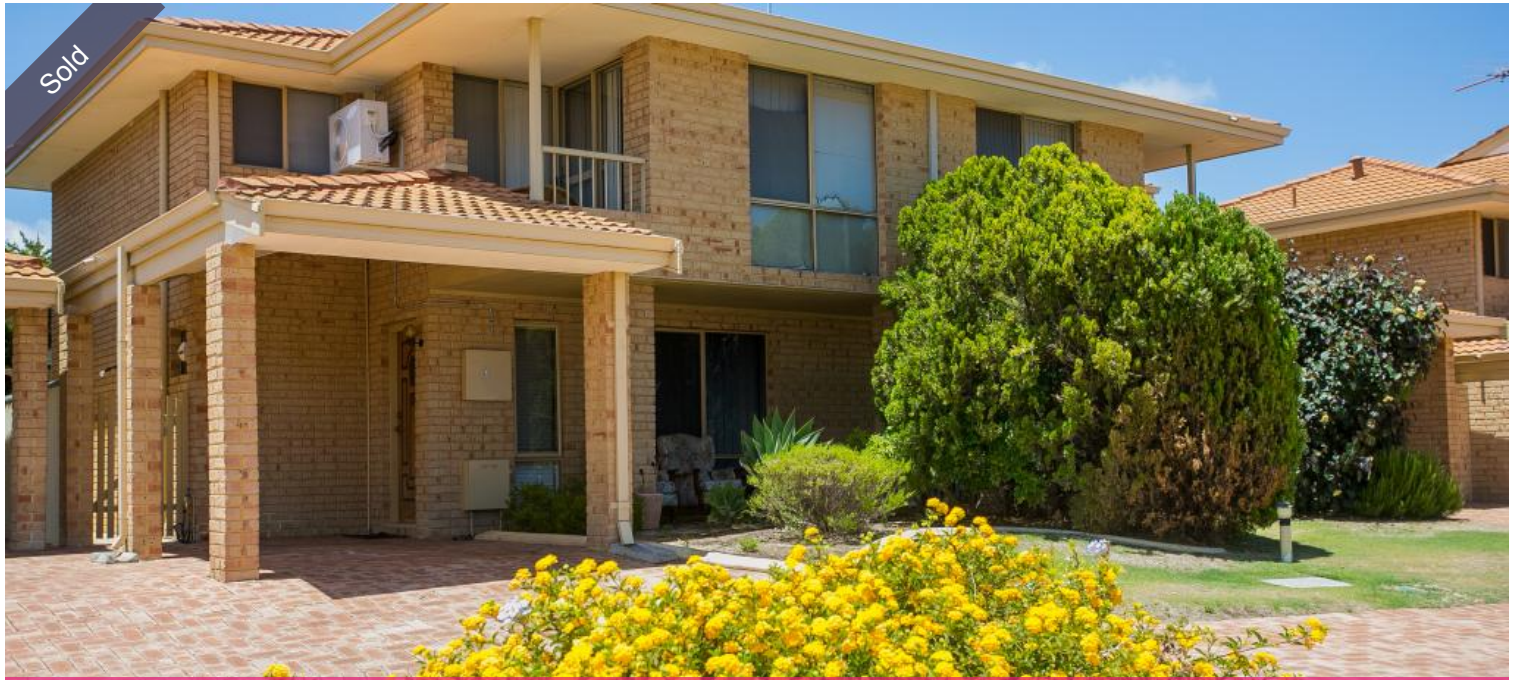
Unit 12, 91 Dampier Avenue, Mullaloo