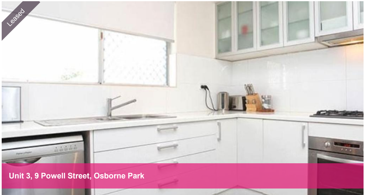
Unit 3, 9 Powell Street, Osborne Park