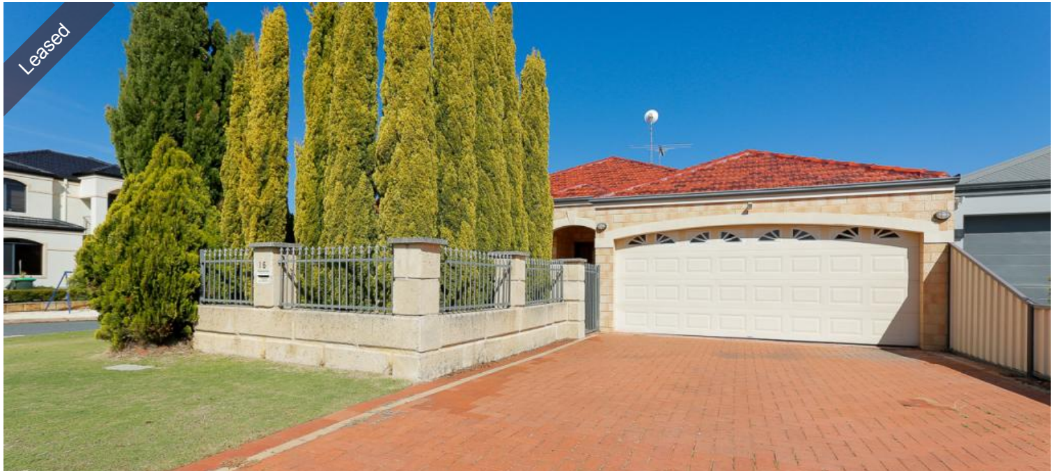
15 Banksaddle Place, Dianella