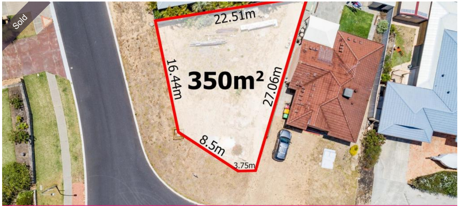
1 Nevoria Place, Padbury