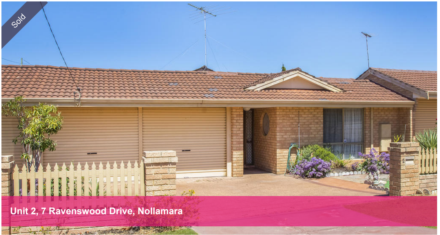
Unit 2, 7 Ravenswood Drive, Nollamara