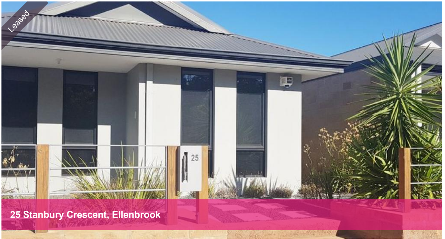
25 Stanbury Crescent, Ellenbrook