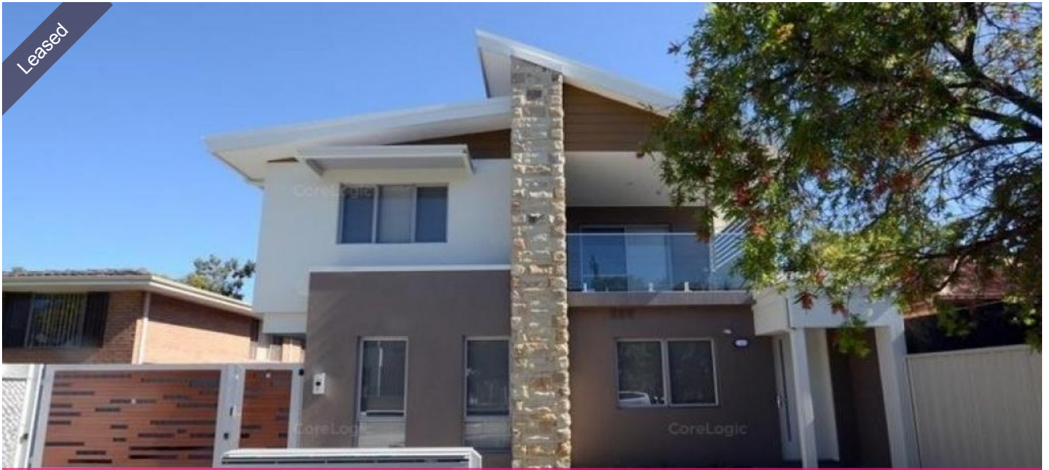
Unit 2/ 124 Richmond St, Leederville