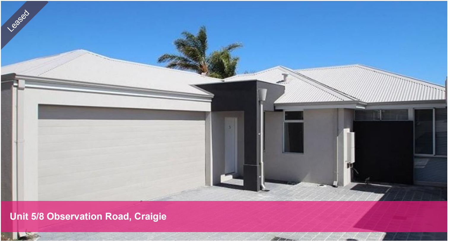
Unit 5/8 Observation Road, Craigie