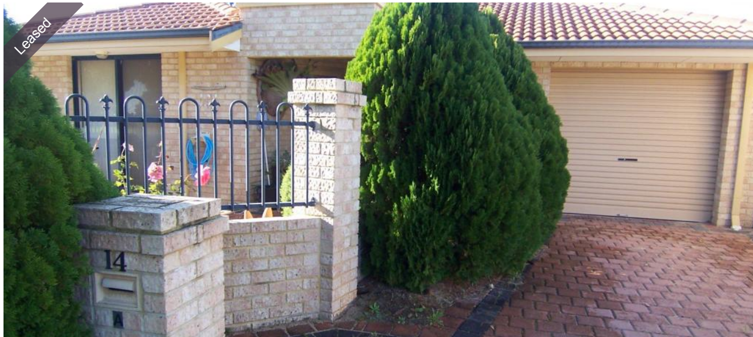
14A Medhurst Crescent, Nollamara