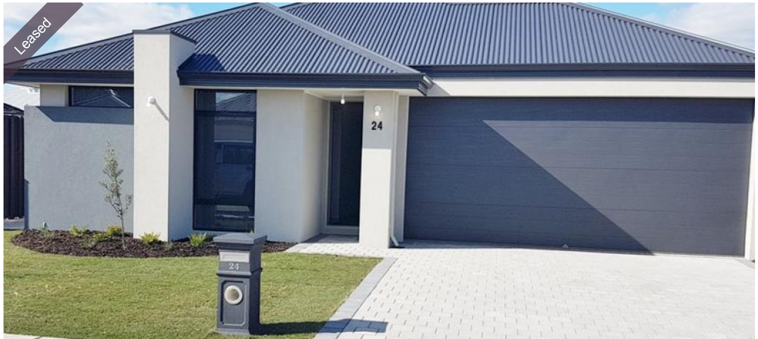
24 Oldfield Chase, Brabham