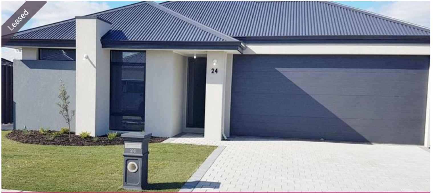
24 Oldfield Chase, Brabham