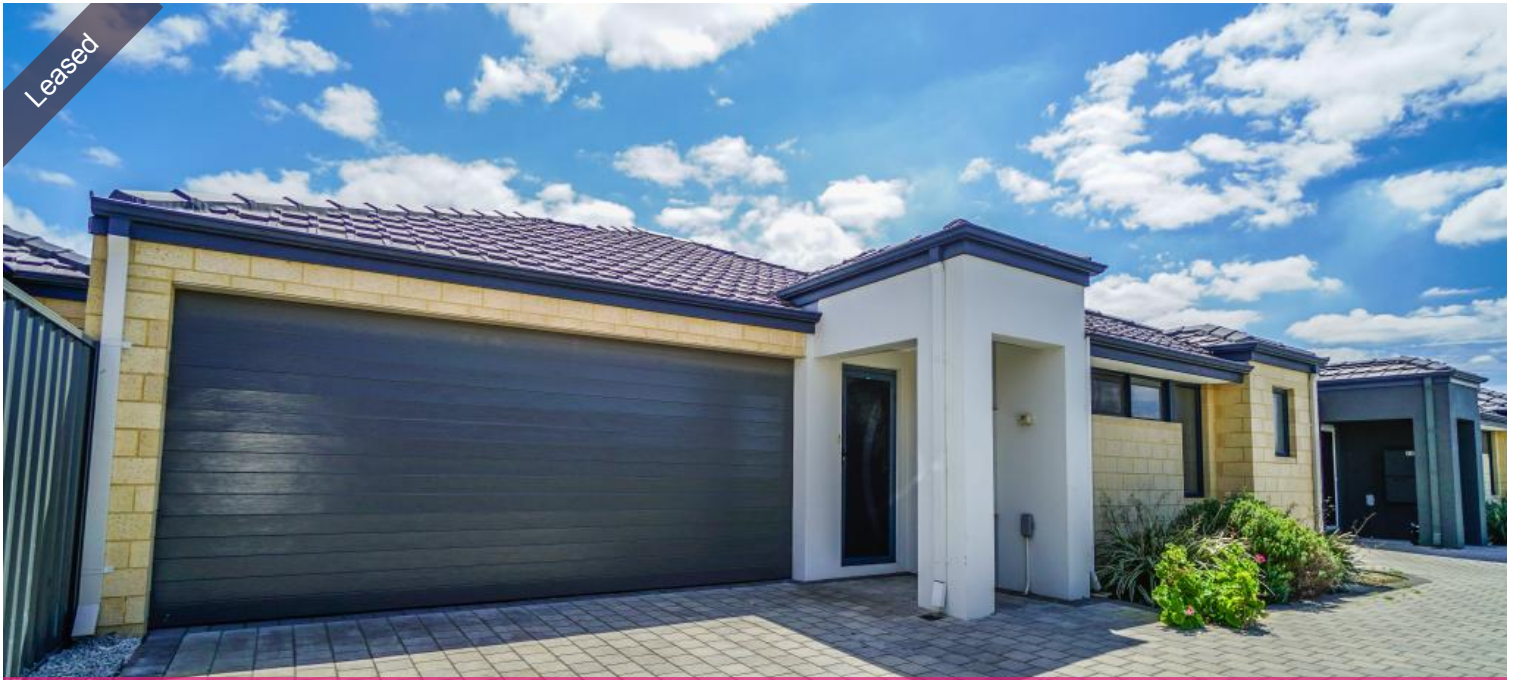
Unit 2/ 42 Wroxton St, Midland