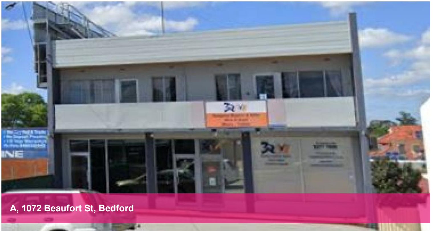
A, 1072 Beaufort St, Bedford