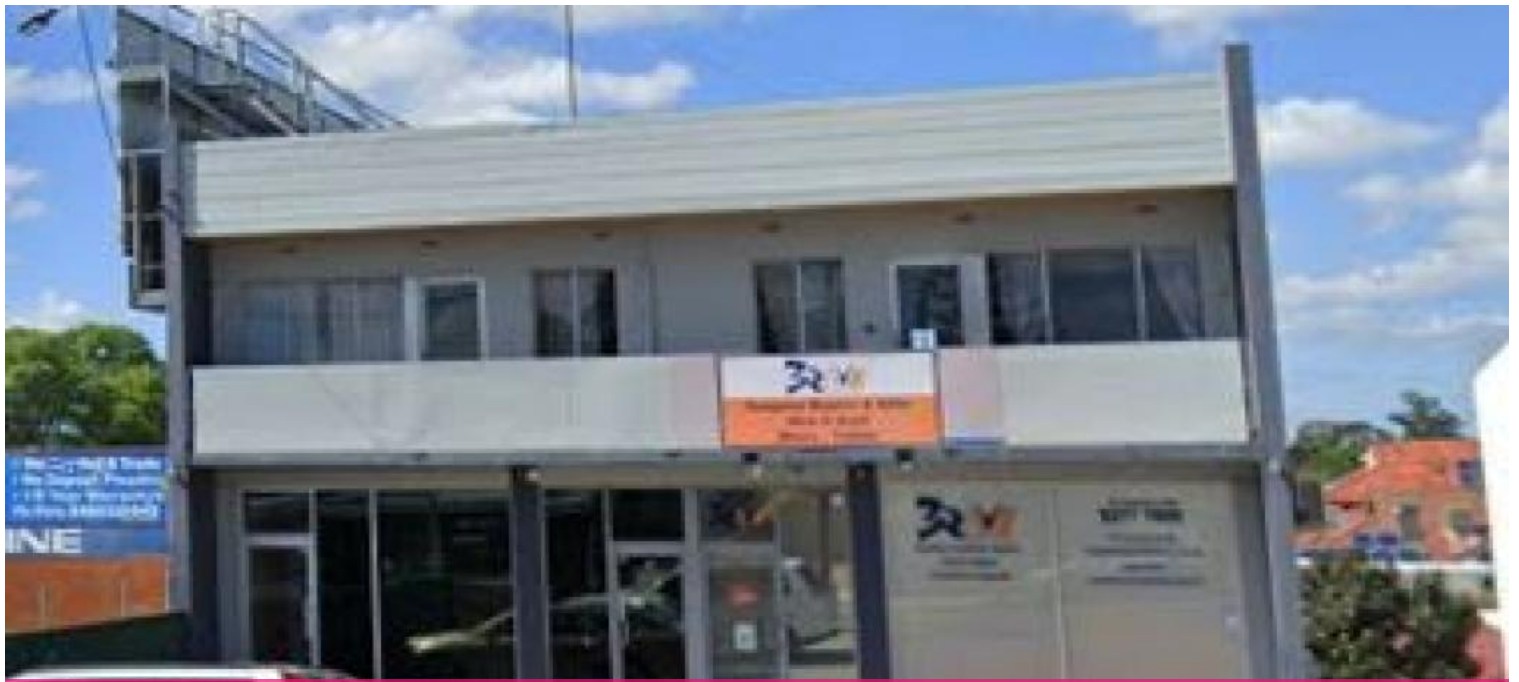
A, 1072 Beaufort St, Bedford