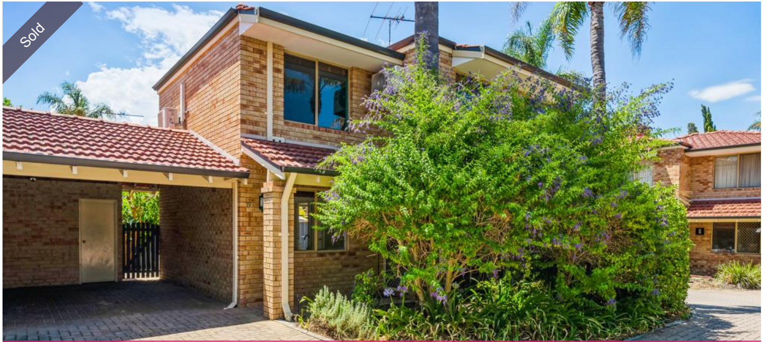
Unit 19, 15 Jugan St, Mount Hawthorn