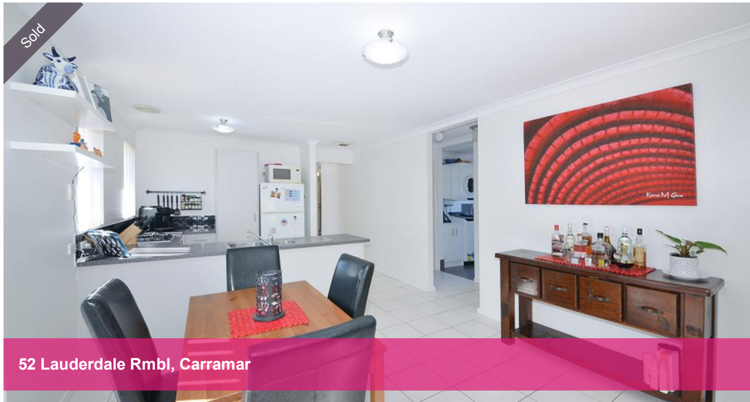
52 Lauderdale Rmbl, Carramar