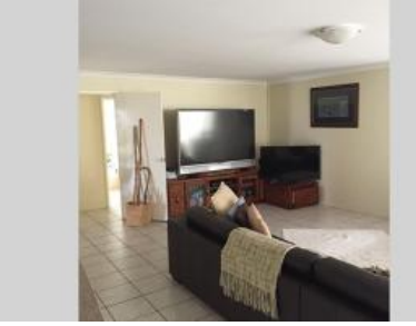
🚔 4 🔊 2 🛱 2

If you would like to book an inspection for this property, then simply scroll down past the description and click the 'Book an Inspection Time' button and select from one of the available times. If no time is currently available, register your interest and you will be alerted when the next inspection time is scheduled