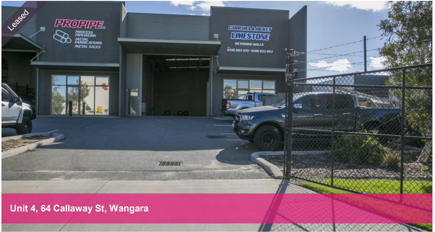
Unit 4, 64 Callaway St, Wangara