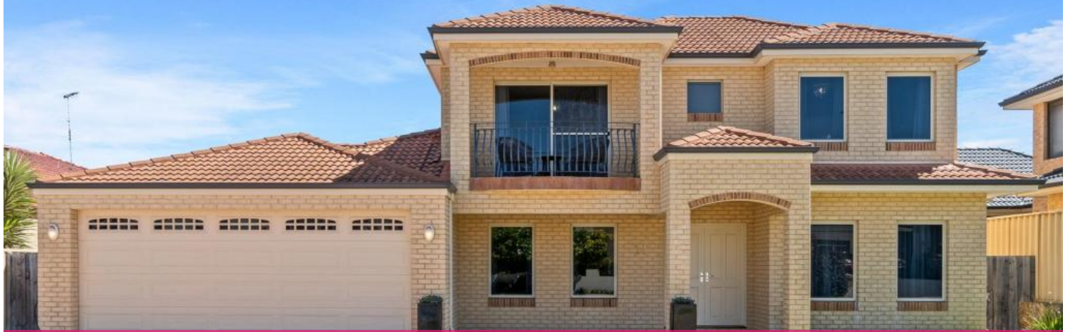
11 Antalya Vista, Iluka