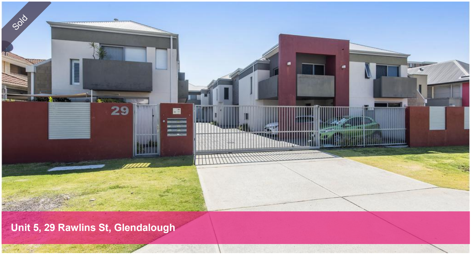
Unit 5, 29 Rawlins St, Glendalough