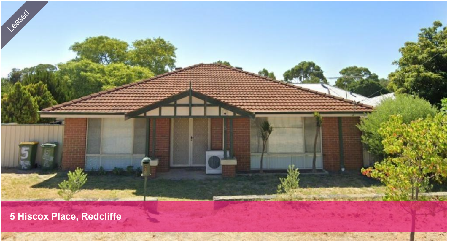
5 Hiscox Place, Redcliffe