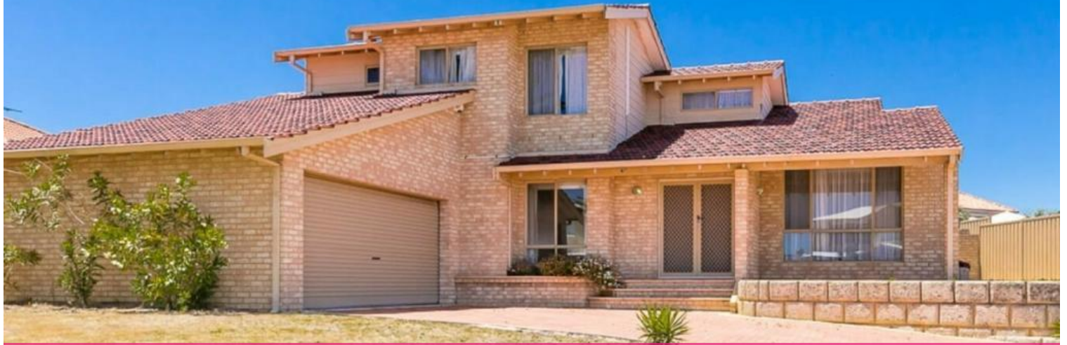
18 Brearley Mews, Hillarys