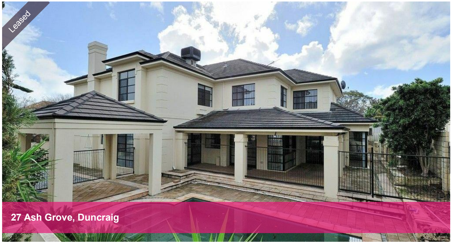
27 Ash Grove, Duncraig