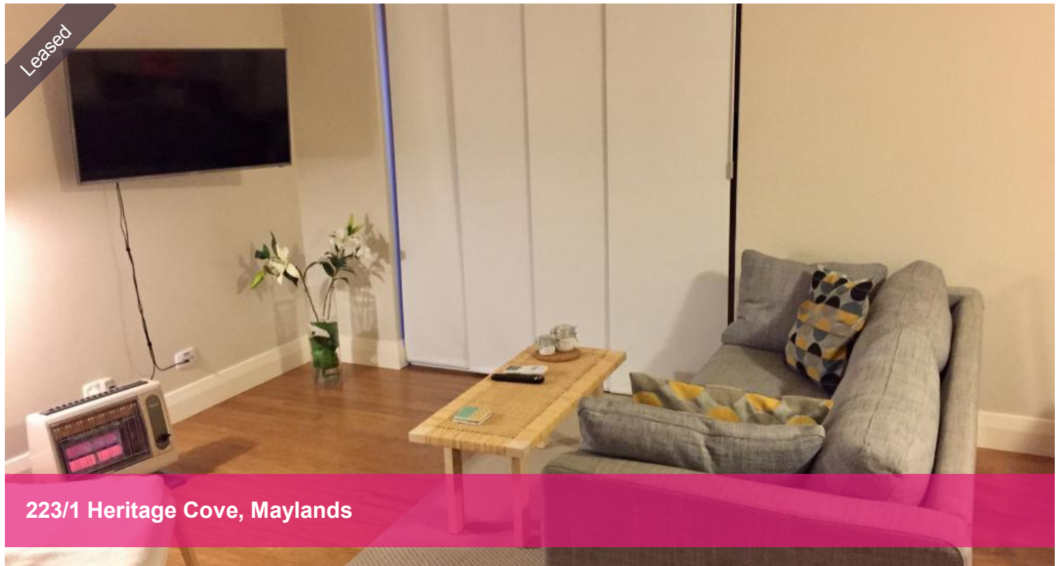
223/1 Heritage Cove, Maylands