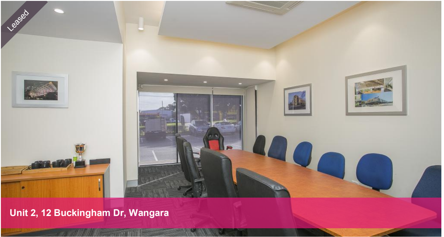
Unit 2, 12 Buckingham Dr, Wangara