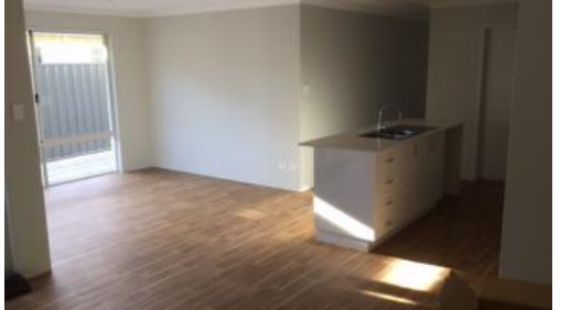
🔚 3 🔊 2 🗐 2