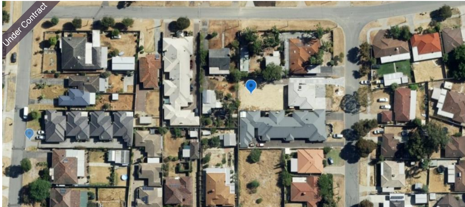
113b Ferguson Street, Midland