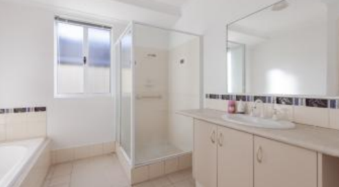
🔚 5 🔊 2 🗐 2