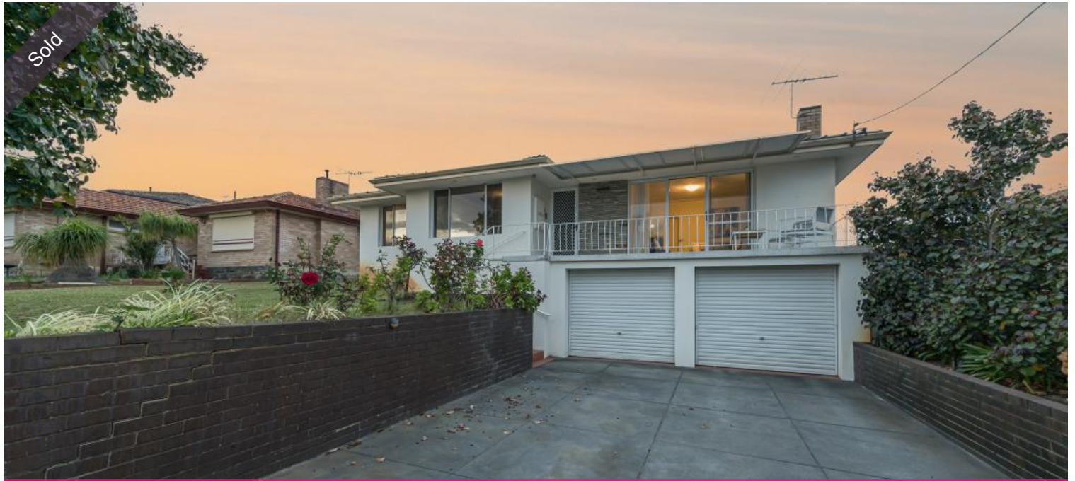
362 The Strand, Dianella