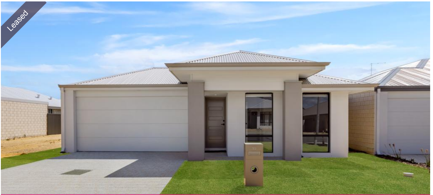
19 Woomera Grange, Byford